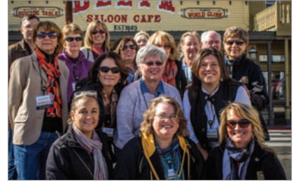
Everyone is rounded up to see a Wild West show.