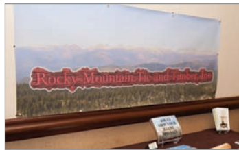
Rocky Mountain Tie & Timber