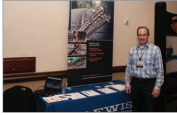
Lewis Bolt & Nut