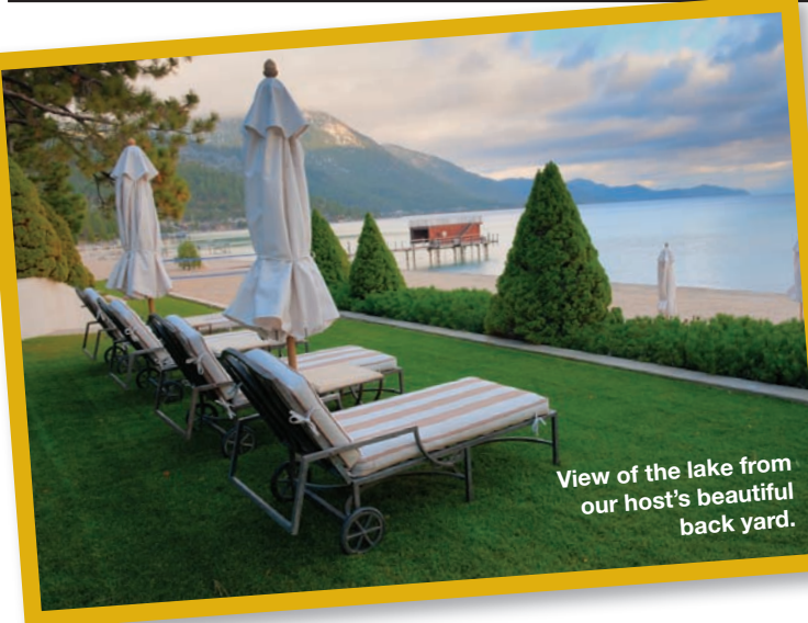
View of the lake from our host's beautiful back yard.