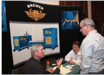
Brewer Machine & Parts