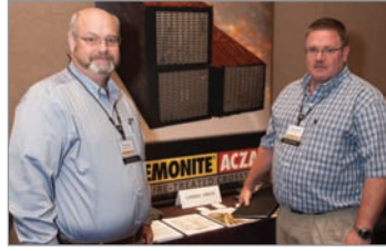
Lonza Wood Protection