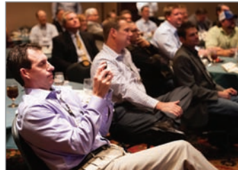
Guests listen attentively to the well-received luncheon presentation.