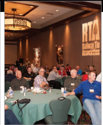
Casino Tournament Group