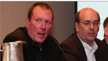
Members of the Railroad Purchasing Forum panel share insight with the audience.