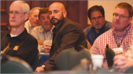
The group listens intently as Class I railroaders describe their purchasing plans for the coming year.

Friday's business session focused on a variety of research initiatives related to preservatives, "green" power and more. The final session of the day focused on tie purchases planned by U.S. railroads for 2014.